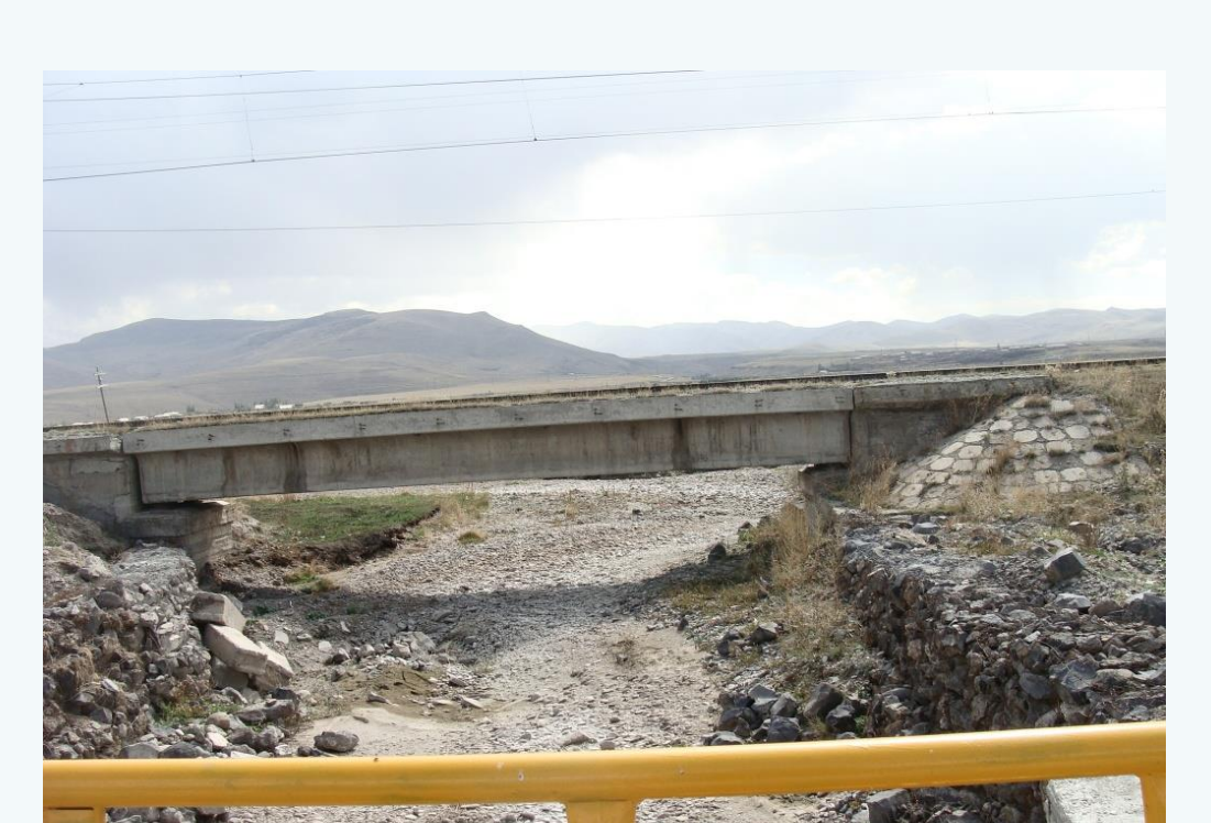
Dry riverbed of middle stream of Masrik river as a result of water withdrawal by SHPP