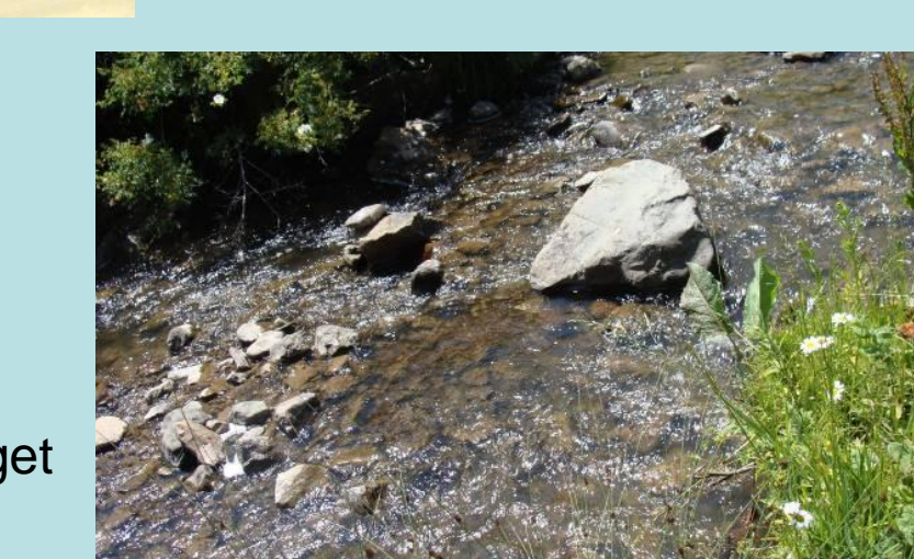
As seen in Table 1, the level of saprobity increases along a watercourse, especially where sewage and municipal solid waste from localities falls into the the riverbed. The process of eutrophication is enhanced under conditions of low water levels due to water withdrawal in the upper reaches for irrigation and

hydropower plants purposes. A major step to solving the problem of water pollution and hydroecosystems restoration was the commissioning of sewage treatment plants for the three major cities of Sevan basin. Today, according to BOD5 data The quality of water in estuaries Gavaraget, Makenis, Dzknaget, Argichi Vardenik corresponds to the α-mezosaprobic and only in the waters of the river Masrik consistent with \alpha -oligosaprobic waters. The next step problem solving the issue of solid waste that needs a full machining solution: educational work with local