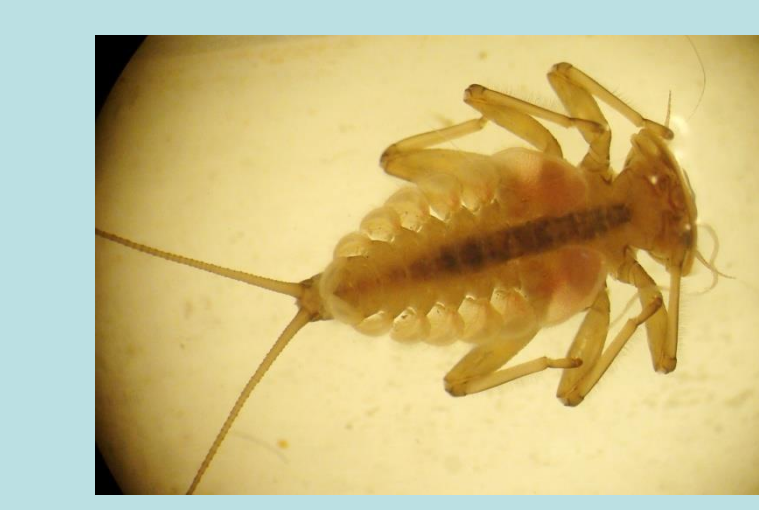
Epeorus (Caucasiron) caucasicus.