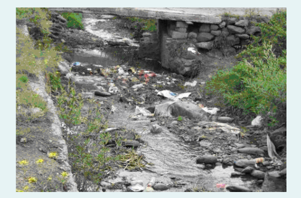
Upstream and downstream of river Gavaraget

communities, the construction of landfills.