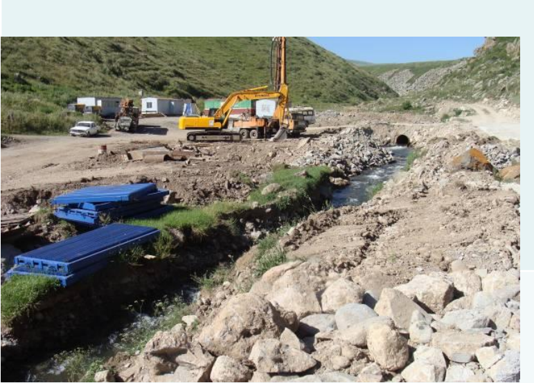
Construction of HPP on river Vardenik.